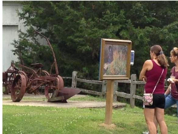
Heritage Festival tour participants, Ray Township – August 2014

Partnering with Macomb County MetroParks, the DIA installed reproductions in Wolcott Mill MetroPark in Ray Township.