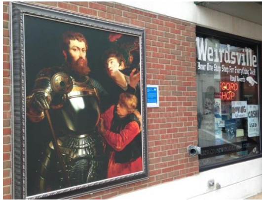
Inside/Out 2014: Warrior with Two Pages by Peter Paul Rubens installed in Mt. Clemens