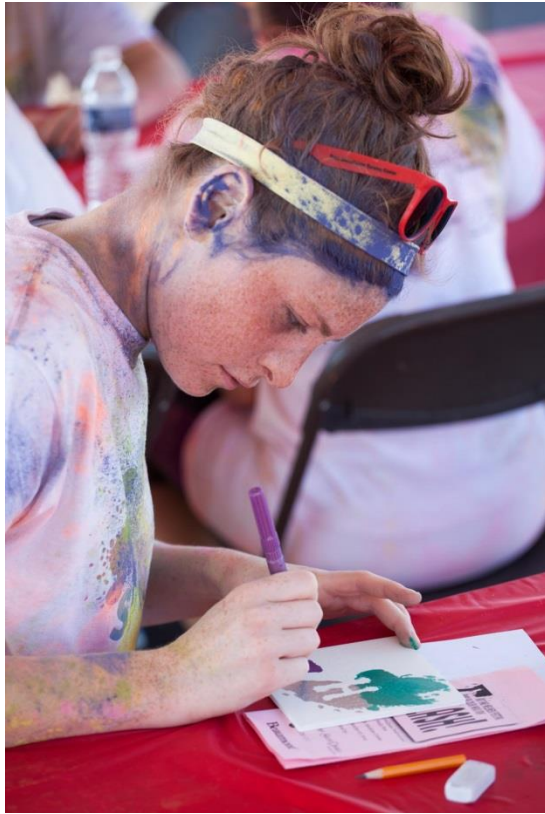
Splash Event Art Making Workshop, St. Clair Shores, MI – September 2014

of the nine Inside|Out reproductions in St. Clair Shores, take free Zumba and yoga classes, and receive information from Beaumont doctors on the health benefits of participation in the performing and fine arts. In addition, DIA studio staff led an art-making project allowing attendees to get first-hand experience on the connection between art and wellness.