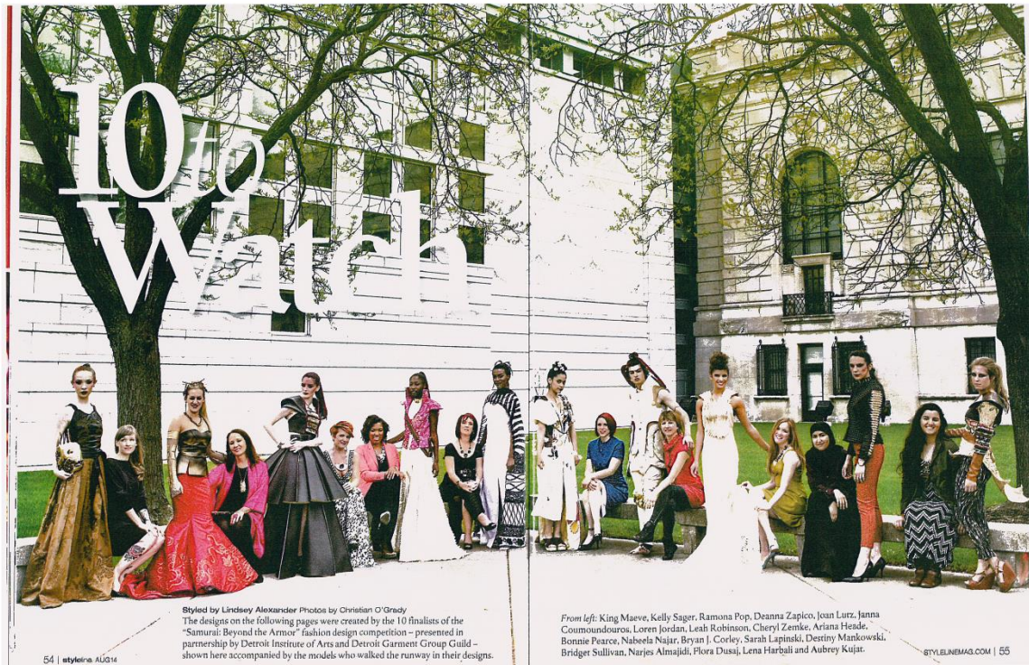
StyleLine Magazine article featuring Beyond the Armor contestants

DIA Inspired: Beyond the Armor was a chance to participate in an artistic response to a DIA exhibition. Beyond the Armor, a fashion-design competition presented in partnership by the DIA and the Detroit Garment Group Guild, invited fashion designers throughout the region to submit ideas to create a one-of-a-kind outfit inspired by the Samurai: Beyond the Sword exhibition. Ten winners were awarded stipends to bring their ideas to fruition. Members of the public cast their votes on the various ensembles by visiting mini-fashion exhibits held around the community for a week in May. Visitors to the mini-exhibitions and the DIA's Facebook page voted for their favorite designs. The winner was announced at a fashion show at the DIA on May 17.