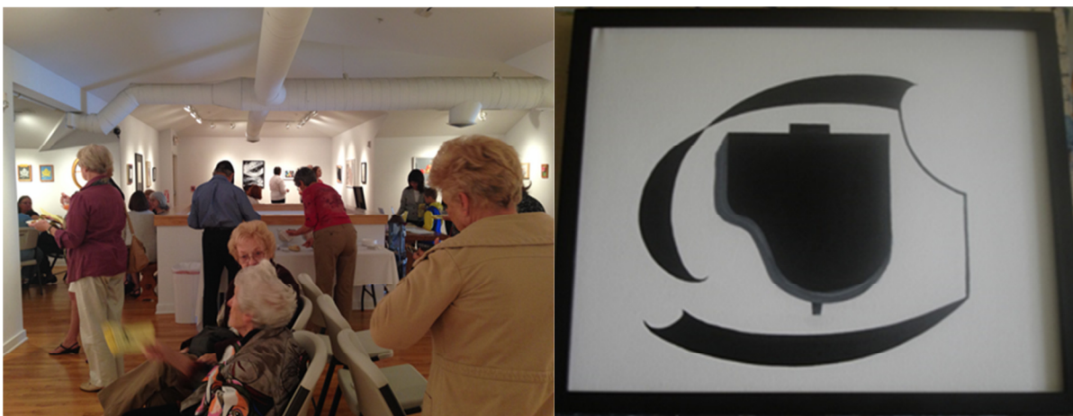
Things I See gallery show and work of art created by community member as part of the program.